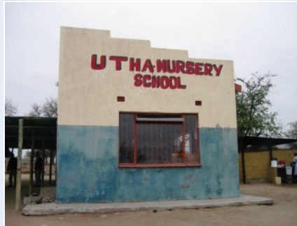
Nursery school in Utha, South Africa