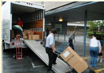
NW Secondary School loading books for Philippines